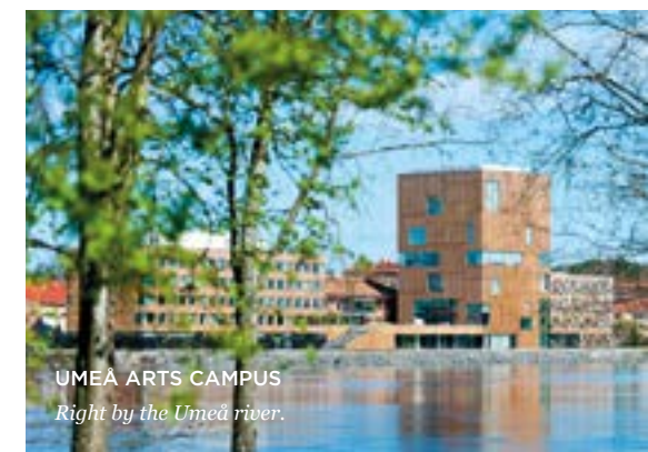
UMEÅ ARTS CAMPUS Right by the Umeå river.