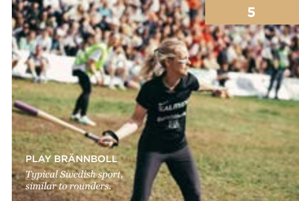
PLAY BRÄNNBOLL Typical Swedish sport, similar to rounders.