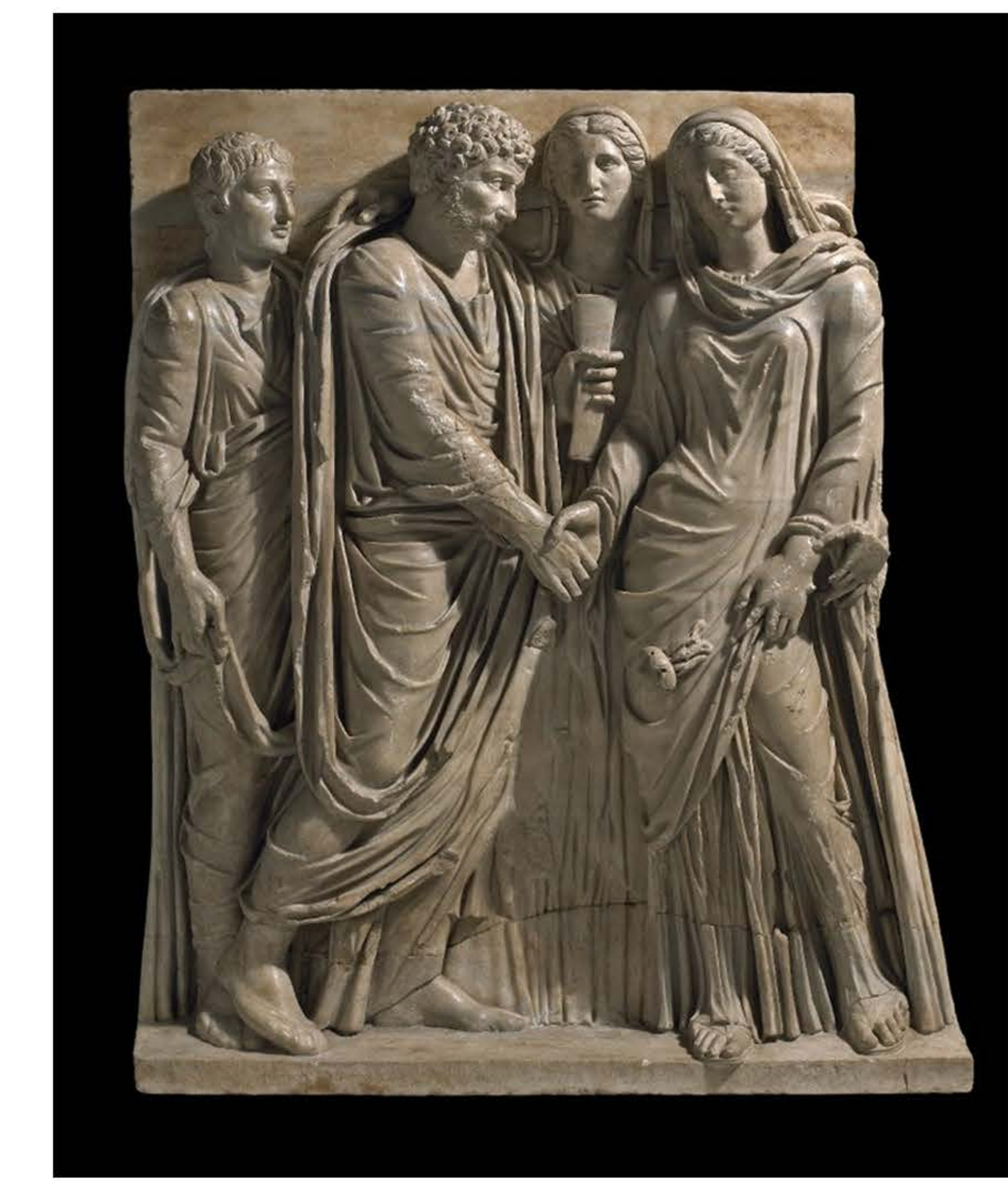
Relief depicting Roman marriage ceremony

Consent and Consensuality in Ancient Greco-Roman Marriage