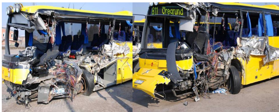
Figure 1. The two buses in the Rasbo crash (57).

The Rasbo crash is one of the worst bus crashes that have happened in Sweden (10). Two commuter buses going in opposite directions at 90 km/h on a two-lane road outside of Rasbo and Uppsala, Sweden, collided in a small overlap crash (see Figure 1). The road was covered in snow slush, and only one lane had been plowed. Six of the 62 passengers were killed instantly in the crash: five persons on one bus and one person on the other bus. Off-duty emergency personnel on their way to work (two fire officers, one intensive care physician, and one ambulance nurse) were the first ones to arrive at the crash site. Together they initiated an emergency response. The physician took an overview of the medical conditions of the injured, and the ambulance nurse contributed by organizing and preparing the care of the injured. Approximately 20 minutes later, official emergency personnel arrived. Most of the passengers were sent to a nearby gathering place, while a few were transported directly to hospitals by ambulance or helicopter. The rest of the survivors were subsequently sent to three different emergency departments (EDs), and the transport time from the time of the crash to arrival at the EDs varied from 1 to 4.5 hours (57).