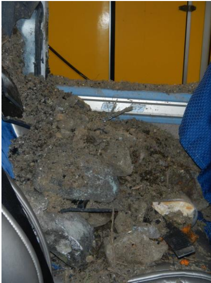
Figure 3. Photo of a seat covered in stones and soil (60).