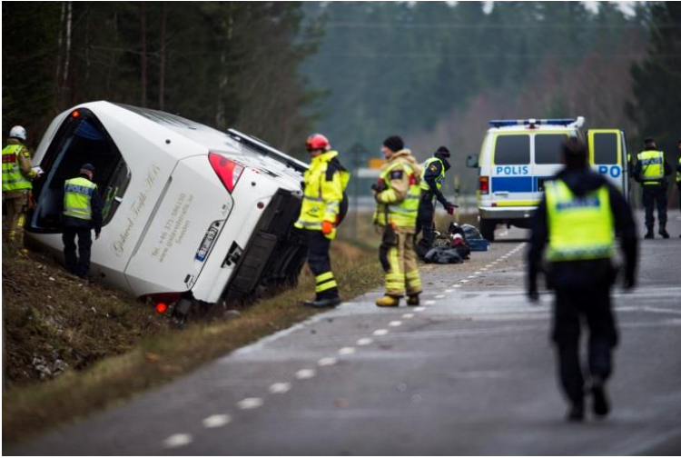
Figure 2. The Tranemo crash site.