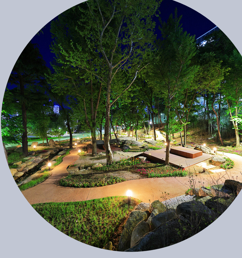
Pusan National University in South Korea

We are continuously reviewing our agreement portfolio to offer more countries for mobility. During the year, we signed two new agreements. One with the Luxembourg School of Business, in Luxembourg, and another with Pusan National University, in South Korea. We now offer students around 70 partner universities to choose from, and our students can also choose from Umeå University's agreements.