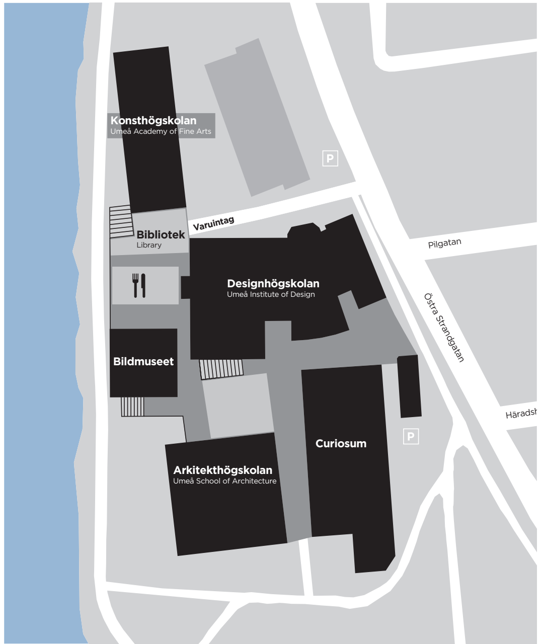
Umeå Arts Campus, Umeå University